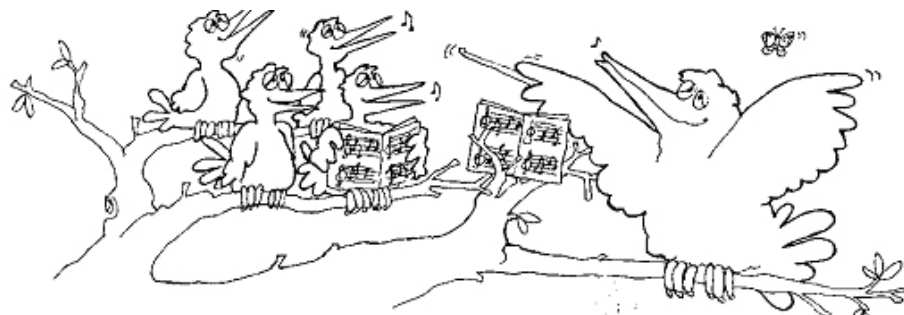
FIGURE: LISTENING POST WORKSHEET

Make a tape recording of your five-minute stay and analyse the findings at a later date. This is an excellent test of your perception.